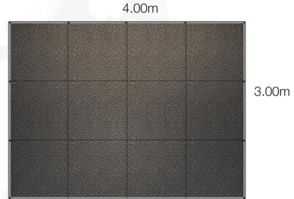
12m 2 - In-Line Booth